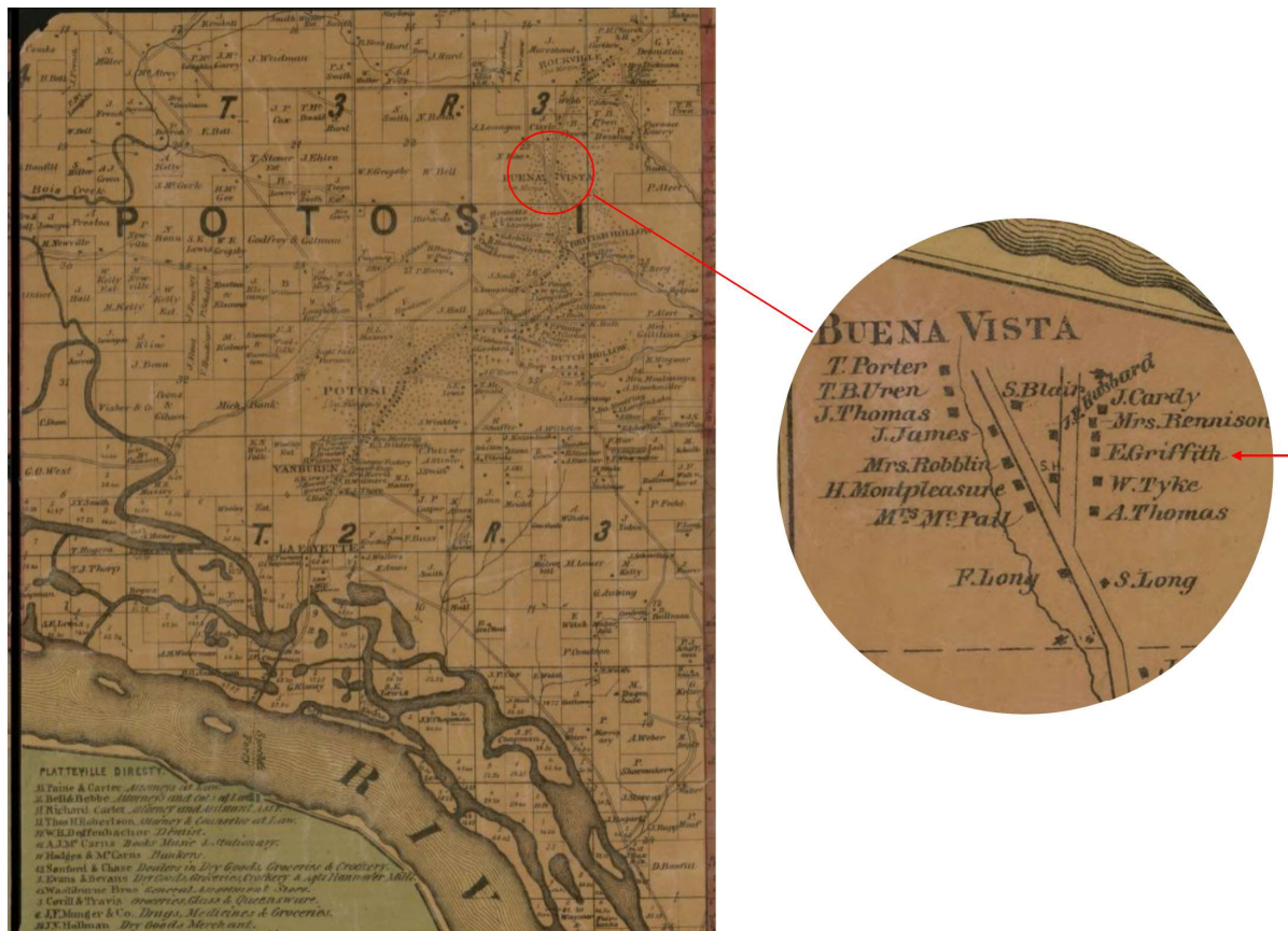
Figure 2 1868 Plat Map of Grant County