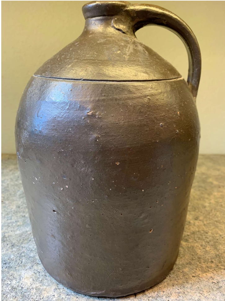
Figure 1 one gallon jug attributed to the British Hollow Pottery. The slip resembles Albany. It is hard and dense, resembling stoneware.